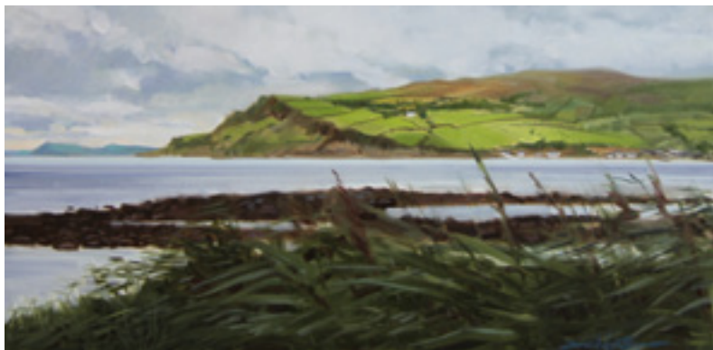
Antrim Coast Paintings Private Collection Various Sizes Oil on Linen or Oil on Canvas